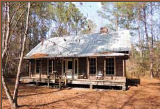
Historic cabin at Seabrook Village