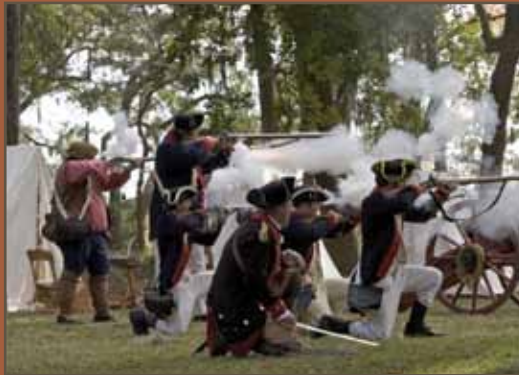
Revolutionary War reenactment at Fort Morris