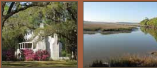
Scenic views of the Midway Museum & Melon Bluff