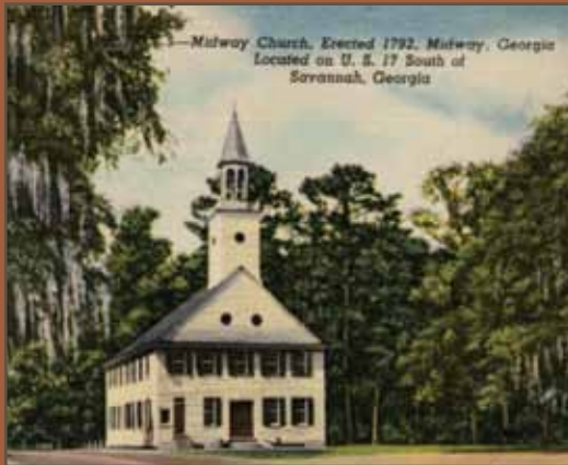
Postcard of Midway Congregational Church