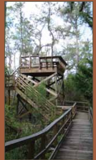
Viewing tower at Cay Creek