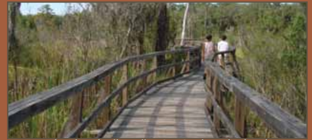
Take a boardwalk stroll at Cay Creek Wetland Park

The Dorchester Academy- Founded after the Civil War for freed slaves, this active community center and the associated Museum of African-American History give a glimpse into the struggles and achievements of African-Americans in Coastal Georgia.