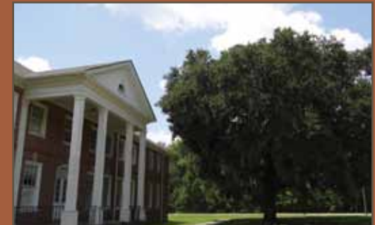
Entrance view of Dorchester Academy, founded in 1869