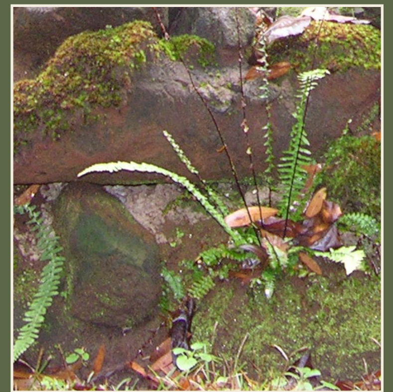
Ebony Spleenwort growing on hardpan